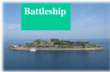
Japanese first apartment

The island's shape resembles the Japanese battleship "Tosa," which leads to the name "Gunkan" (battleship in Japanese).