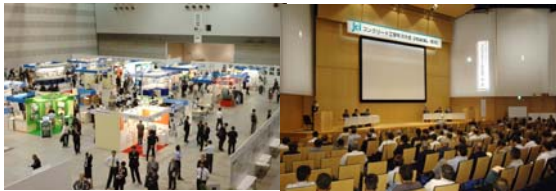
Takamatsu in 2014 Makuhari(Chiba) in 2015