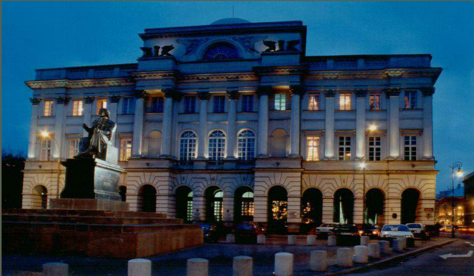
Headquarters of the Polish Academy of Sciences