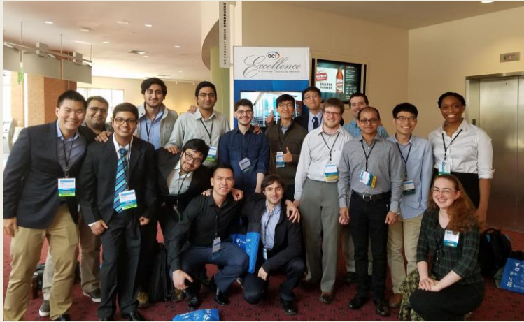
ACI Convention: Milwaukee 2016