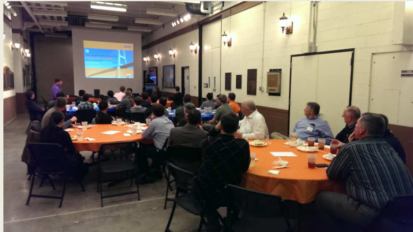
ACI-IL Joint Dinner (2016)