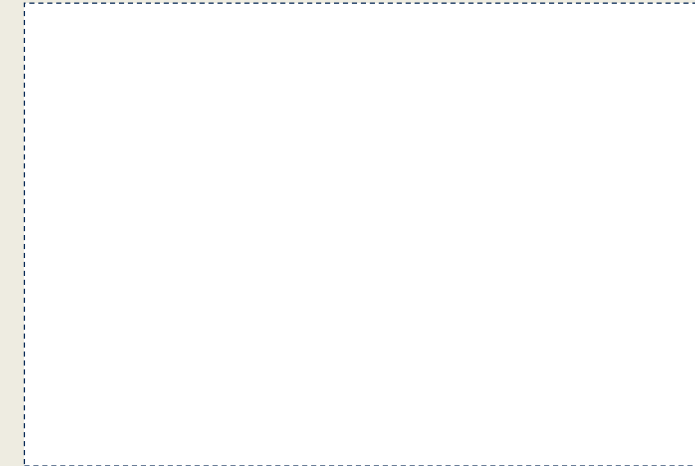
ACI Convention: Detroit 2017 (18 Students in attendance)