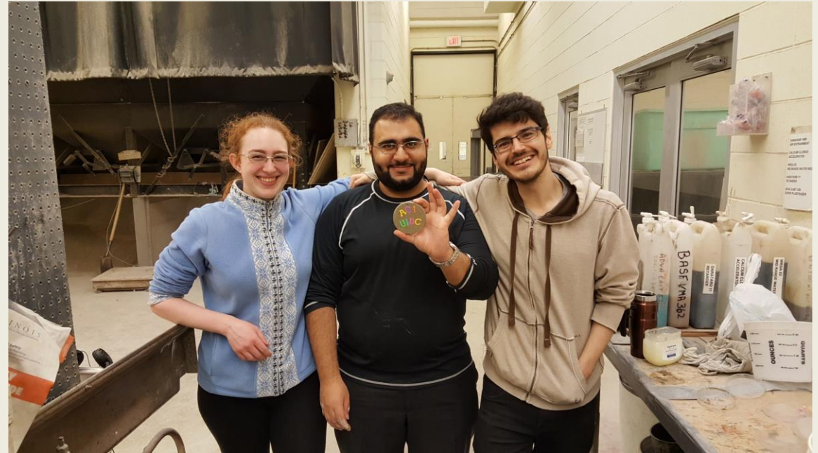
Engineering Open House (2017) Concrete Coaster Exhibit