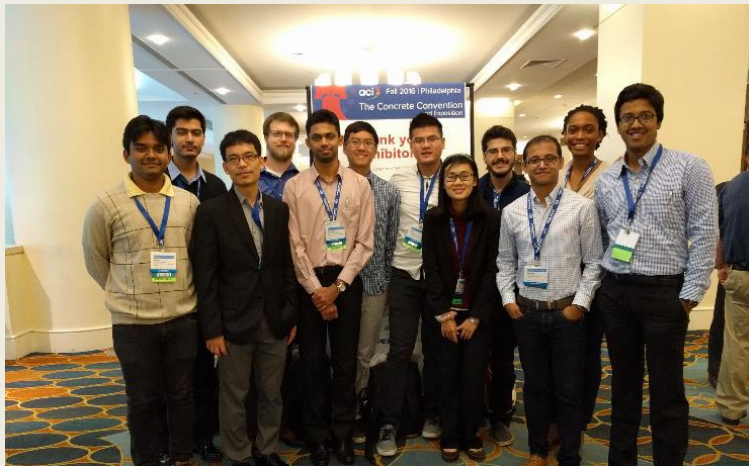
ACI Convention: Philadelphia 2016