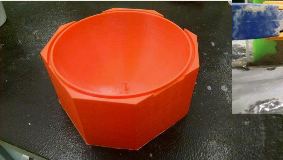
3D printed mold for concrete bowling ball