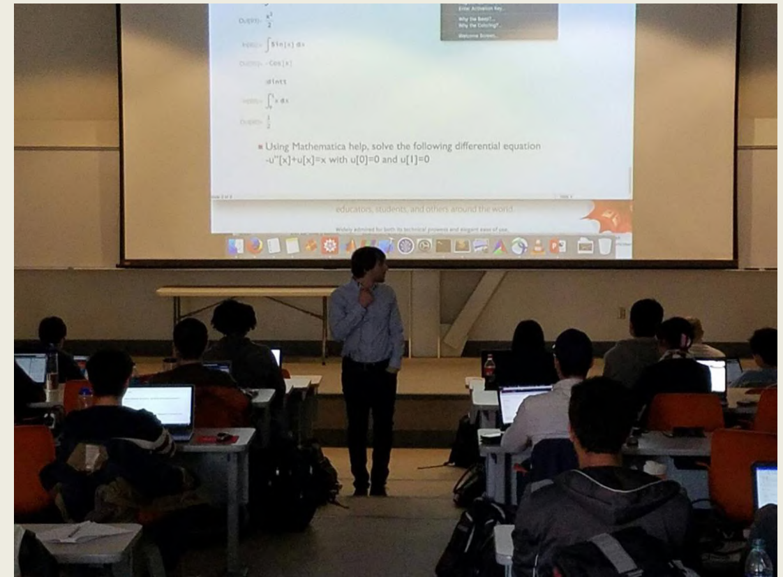
Mathematica Workshop (over 50 people attended)