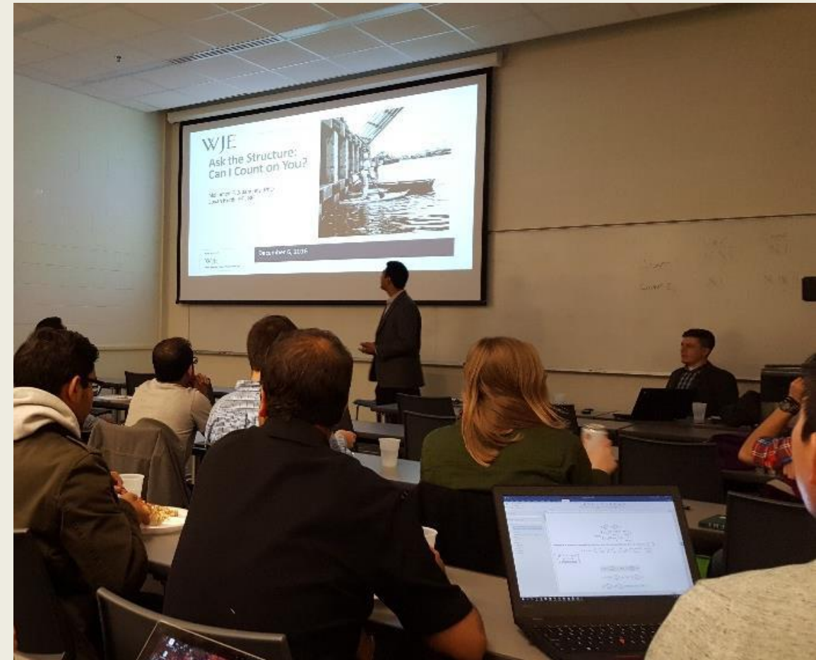
General Meeting (WJE Presentation)