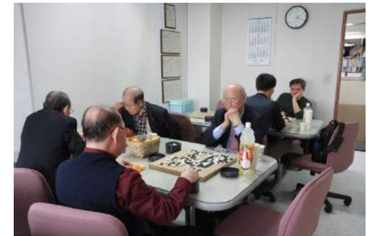
Baduk (GO) Contest