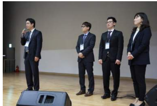
Young researchers' introduction