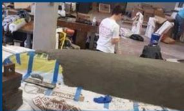
Applied our concrete mix to the male mold