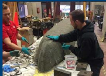
Touched up the end caps with concrete mix then proceeded to smooth out the concrete